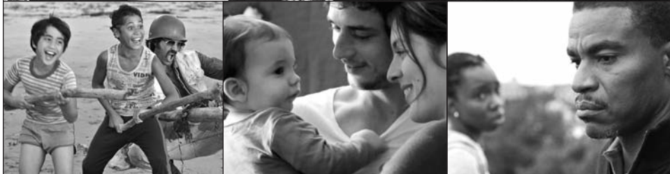
(cover) Tom Hiddleston and Rachel Weisz in The Deep Blue Sea (above) Glenn Close in Albert Nobbs (l to r) Boy , Declaration of War , Pariah

There are several benefits of becoming a Cinema Sundays member. First, you will receive a benefits package chock full of coupons from local businesses. Second, you will be guaranteed a seat, we do occasionally sell out. We are trying to make membership as easy as possible. If you try Cinema Sundays once, you may apply the full price of one walk-up ticket to either a full or partial membership.